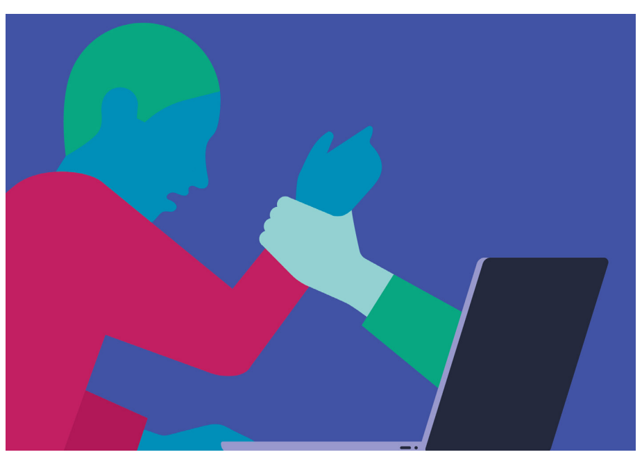
Is a good friend coming under a bad influence?

As each case is formed to meet the needs of the individual concerned, the nature and duration of the support offered by Channel is not fixed and entirely dependent on the wellbeing and progress of the individual. However, Channel is a voluntary process, and although we encourage anyone within the programme to stick with it, they may always withdraw if they wish.