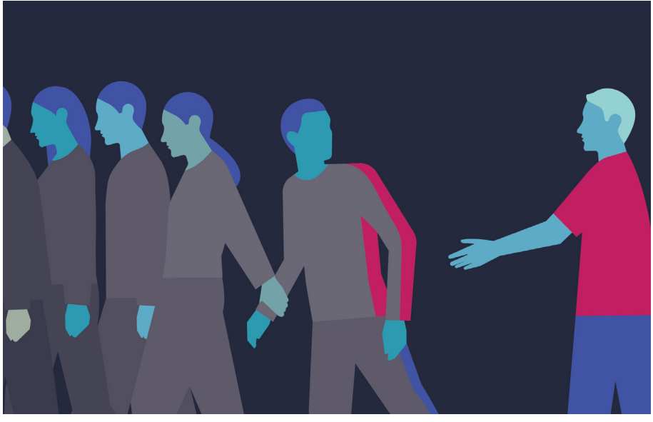
Is someone close becoming a stranger?

We understand you might be feeling worried, but every year we help and support thousands of people just like you, who are concerned about a friend or loved one and want them to receive the help they need to turn things around before the problem gets worse.